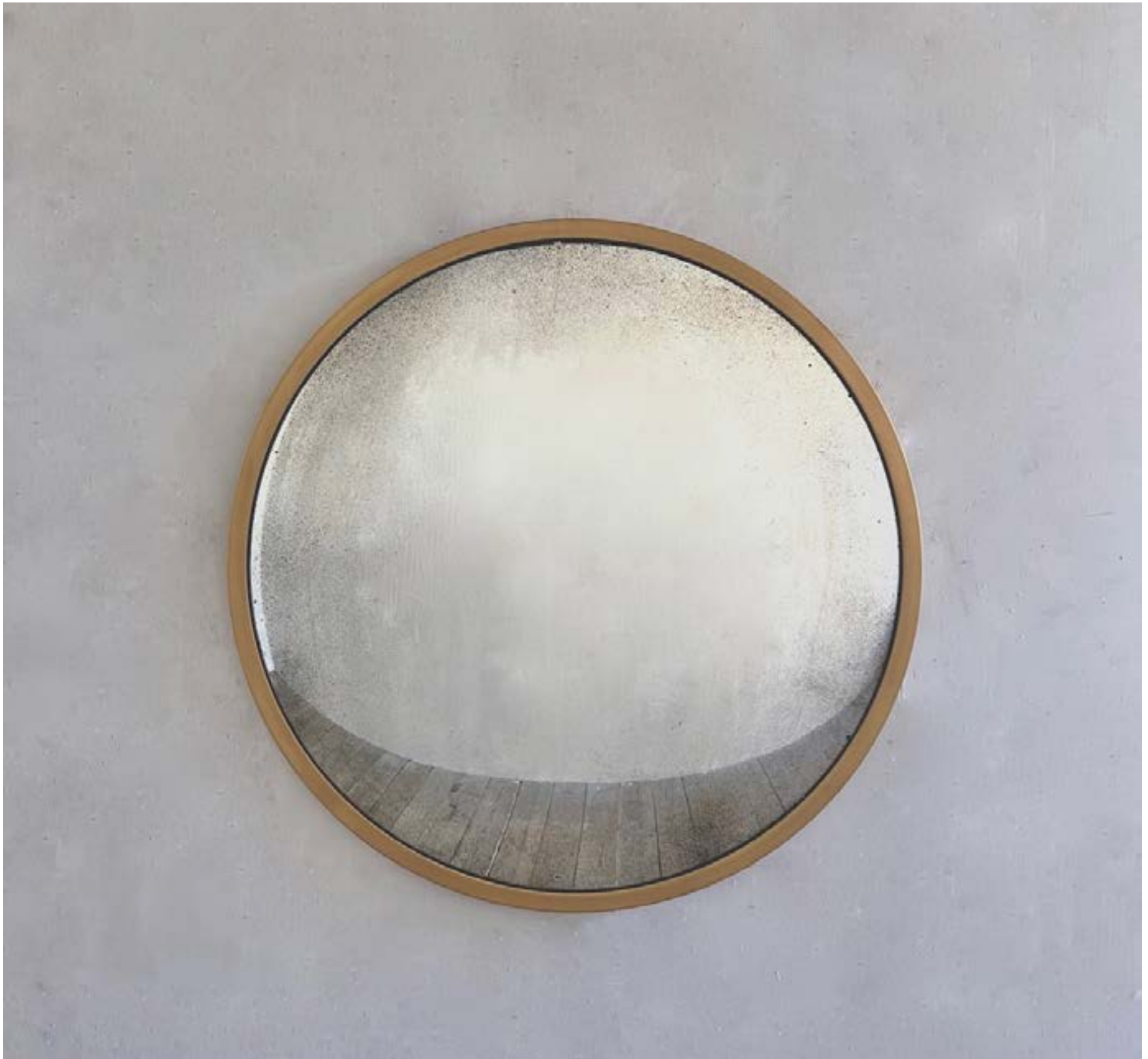
The oculus convex mirror in brass | honey